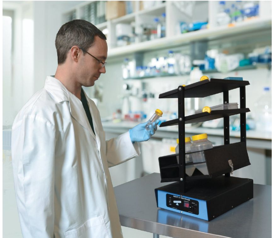
The Infinity Rocker Stack-3. Stack-4 is shown on reverse side.