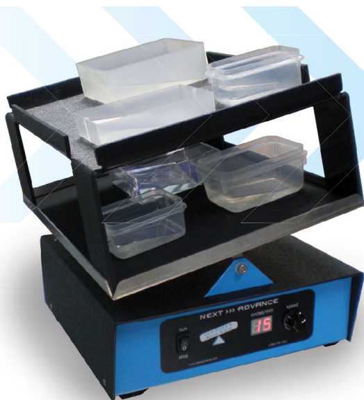
The Infinity Rocker Pro with Stacking Tray